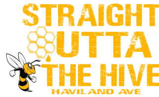
C- SS Tshirt/LS/Hoodie

Audubon is Choice A and Haviland "H" logo is Choice B short sleeve: Heather Green long sleeve T (LS) and hoodie: Charcoal Gray